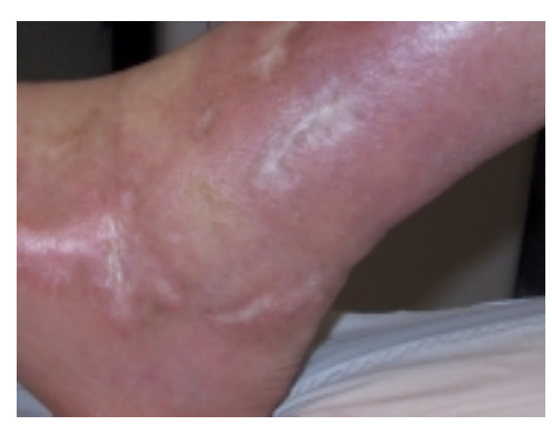
Fig 1 Fig 2